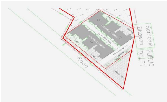
Location Map & Site Plan