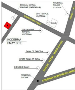
Location Map & Site Plan